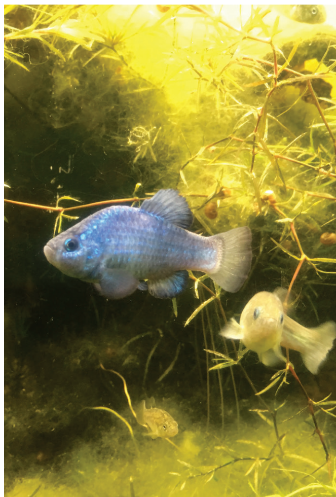
Quitobaquito pupfish

El Gran Desierto de Altar is the largest active dune system in North America and is known for its magnificent star and crescent dunes. Most of the Gran Desierto is in Mexico but part of this system extends into the U.S. and is known as the Pinta Sands. Many species of plants and animals are found only in the Gran Desierto, such as the fringe toed lizard, flat-tailed horned lizard, giant Spanish