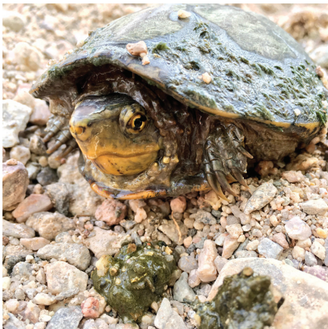
Sonoyta mud turtle

lives serve as reminders of frontier lifeways. The Grays left behind a ranch house, outbuildings, corrals, and a farm field that are part of a cultural landscape listed on the National Register of Historic Places. These historic features overlay important prehistoric sites.