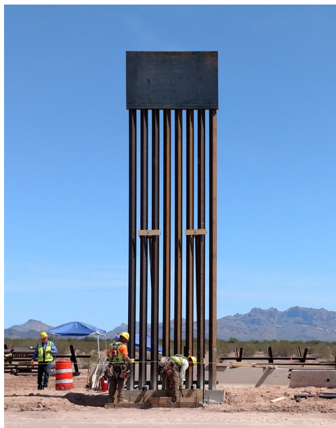
Border wall construction, August 22 nd , 2019, Anonymous