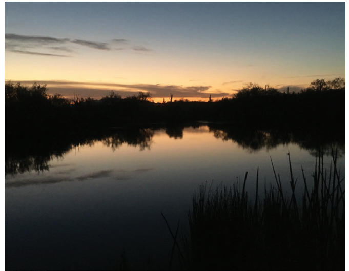
Quitobaquito Springs

In the middle of the hot, dry desert lies Las Playas, a group of dry lake beds with no drainage outlets. When the rare rain falls in the central part of Cabeza Prieta, it flows into the ephemeral lakes, located next to the international boundary. When the playas are wet, the flora and fauna come to life and the playas become islands of emerald green. They host a number of plant and animal species that are rare in the U.S. or Sonoran Desert, including the federally endangered Sonoran pronghorn. Forage areas such as the playas will become increasingly important as the climate becomes hotter and drier. For this reason, Las Playas is a unique biological resource.