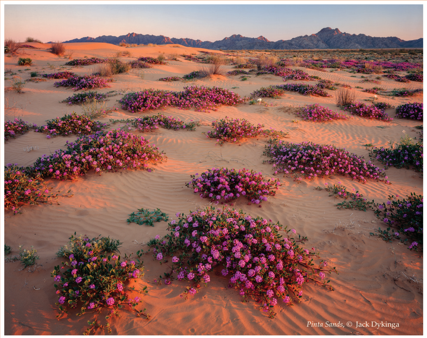
Pinta Sands